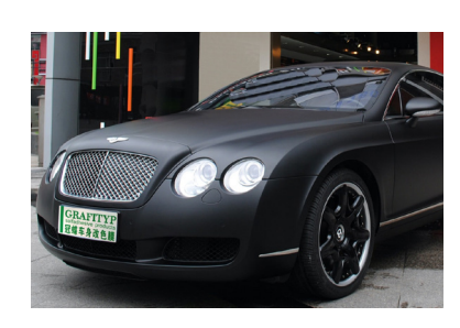
Fleet marking \bullet Tuning \bullet Race cars \bullet Additional protection \bullet \dots