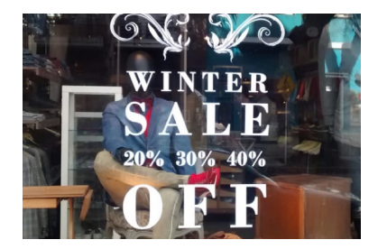
Shop windows • Exposition stands • Advertising panels • Interior elements • Light boxes • Fleet advertising • ...